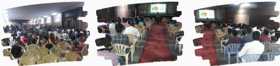
Department of Civil Engineering has organized a Guest Lecture on Enhancing Excellence of Concrete Construction in Coastal Areas.