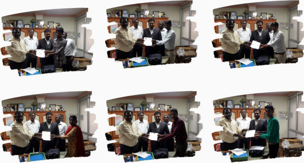
SVCET students got placed in 'Ladder Land Surveys Pvt. Ltd.' during On-Campus Drive held at the institution on 31-01-2020.